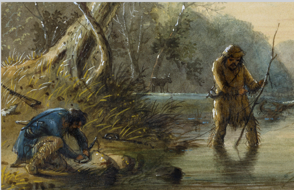
Detail of “Trapping Beavers” by Alfred Jacob Miller (artwork not for sale)